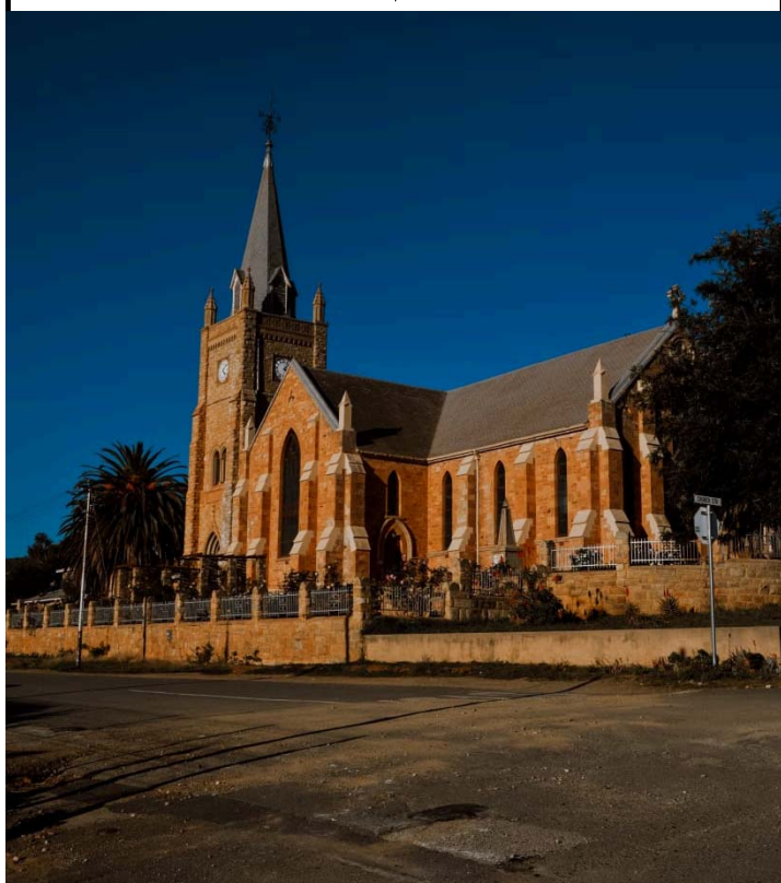
THE NG CHURCH AT SUNSET. SUBMITTED BY JEAN-MARIE BRIGGS.