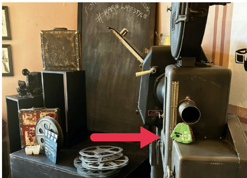
THE APOLLO THEATRE, VICTORIA WEST.

The Karoo Rocks! project has taken off, with our rocks being taken and transported from Brazil to Betty's Bay. Currently available at Karoo Serenity, The Happy Hookers, The Hungry Ghost and The Aloe Cafe. Please contact us should you want rocks at your business. Or if you would like to get involved in painting them. Making the world a smaller place, one rock at a time.