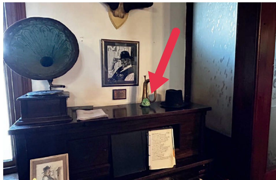
THE LORD MILNER HOTEL, MATJIESFONTEIN.